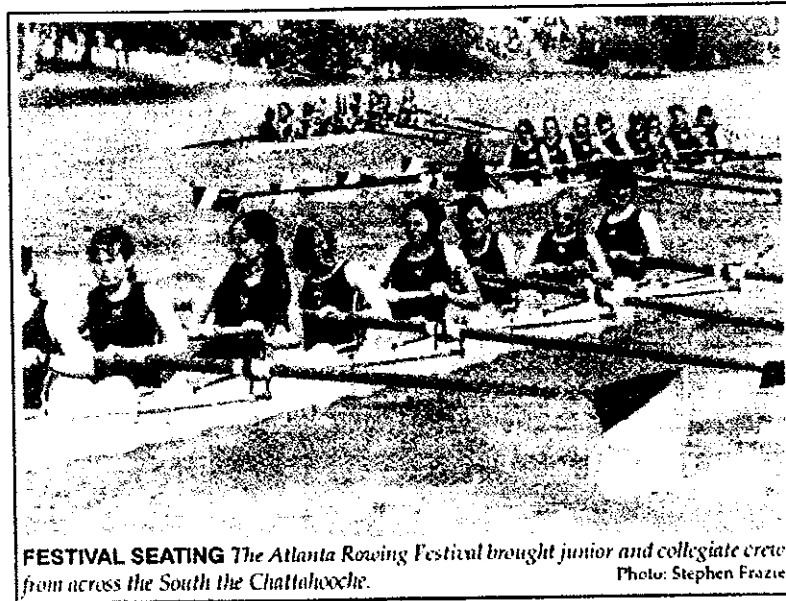
SA girls attack the Chattahoochee in the 1997 Atlanta Rowing Festival, later renamed in honor of John Hunter